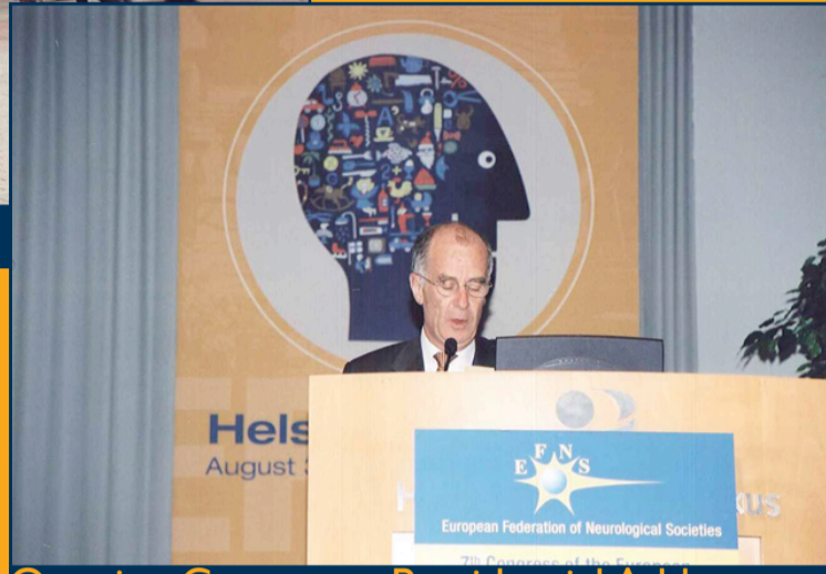
Opening Ceremony, Presidential Address