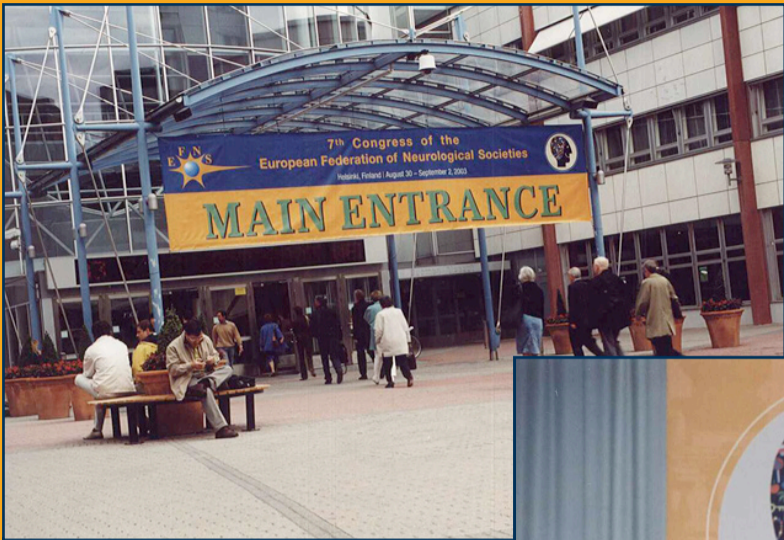
Entrance Congress Building